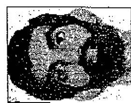
Yousef: Trained by militant Muslims

reer the self-proclaimed "explosives expert" is linked to planned assassination attempts against Pope John Paul II, Pakistani Prime Minister Benazir Bhutto and Philippine President Fidel Ramos. Prosecutors are expected to begin presenting evidence in two weeks at Yousef's trial on charges he planted a bomb that ripped a hole in a Philippine airliner in December 1994. A Japanese passenger died and 10 others were injured. Investigators say it was a cold-blooded test for an apoca-